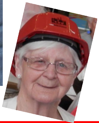
Exploring the memorabilia at the Museum and some of the ladies trying a helmet for size!