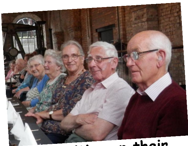
Waiting on their Fish & Chips