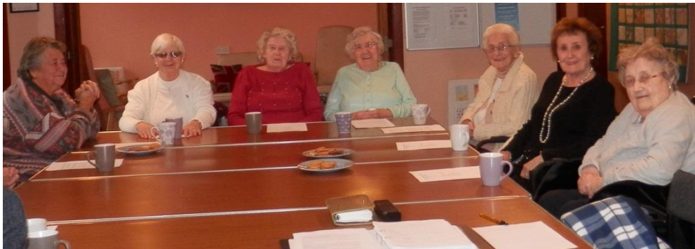
Project User Group in session

If you would like to be a part of the Management you can be proposed, seconded and duly elected at the AGM. Please speak to the Co-ordinator or any of the Management as soon as possible and your nomination can be presented at the AGM