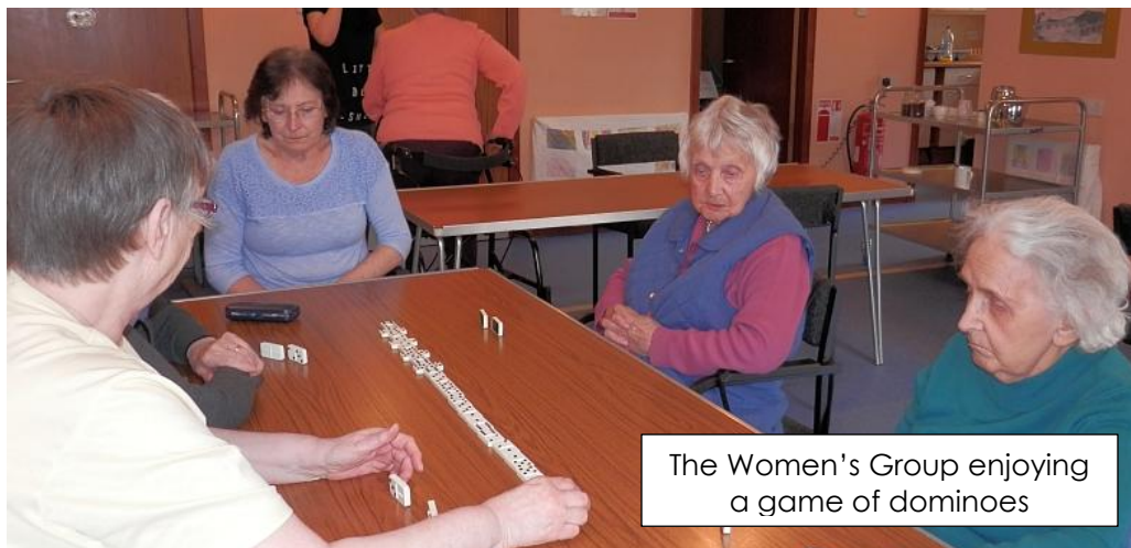
The Women's Group enjoying a game of dominoes